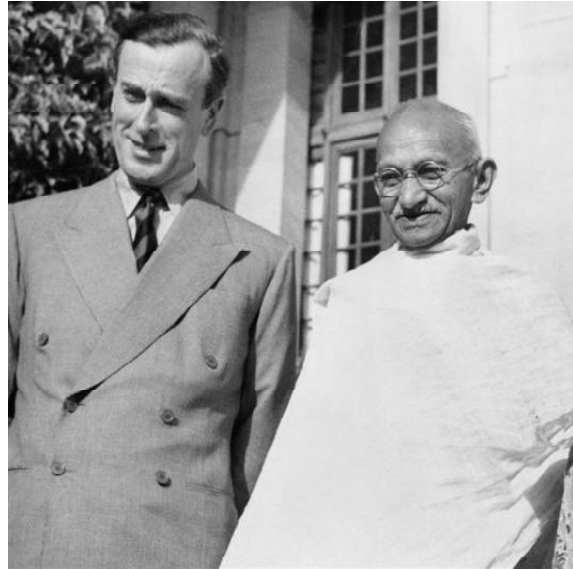
Mount Batten with Gandhiji