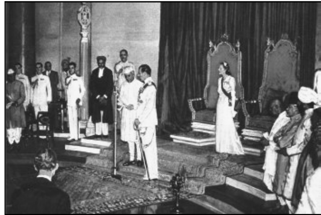
Transfer of power

A fast directed to the conscience of all Hindus and Muslims in India and Pakistan.