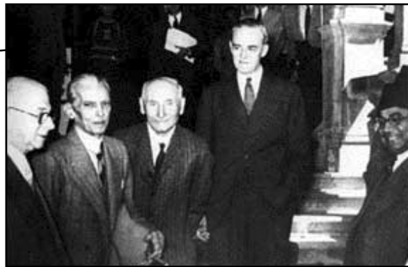
Quaid-i-Azam with members of the Cabinet Mission: Mr. Alexander (left), Lord Pethic Lawrence and Sir Stafford Cripps; Mr. Liaquat Ali Khan is on the extreme right